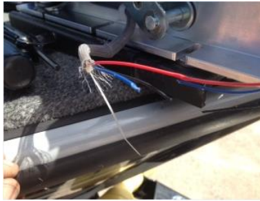
Figure 1: Actual photo supplied by a service provider.

mounting bolts do not damage the wires when the bolts are tightened. The cutting of any of the sensor wires will cause the motor to be inoperative.